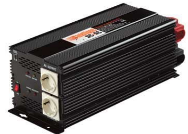
12V or 24V inverter